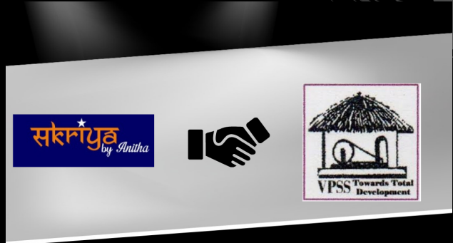
Vedchi Pradesh Seva Samiti VPSS Daman Diu

Target Intervention, Project manager, Adivasi Community, Daman